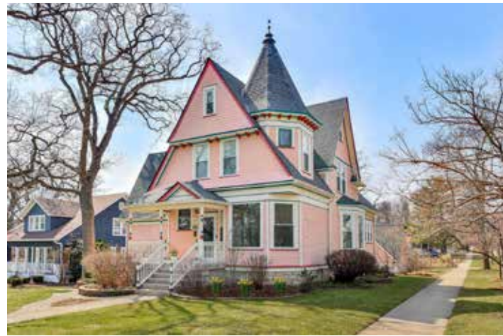
644 N. Main St.