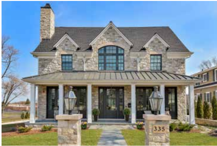
335 Taylor Ave.