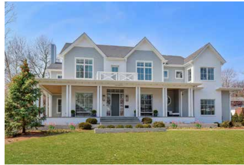
680 Lenox Road