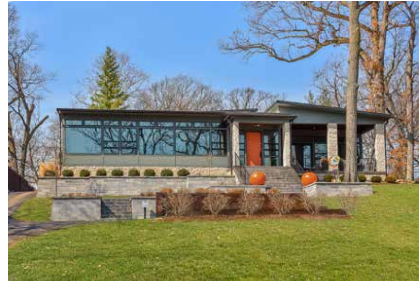
732 Crescent Blvd.

On Friday, May 6, Glen Ellyn Infant Welfare (GEIW) hosted the 37th Annual Housewalk, welcoming more than 1,000 area residents to tour four unique homes while helping to raise funds for more than 20 local nonprofits in DuPage County.