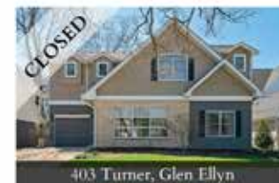
403 Turner, Glen Ellyn