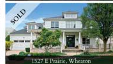
1527 E Prairie, Wheaton