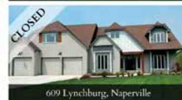
609 Lynchburg, Naperville