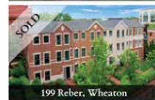
199 Reber, Wheaton