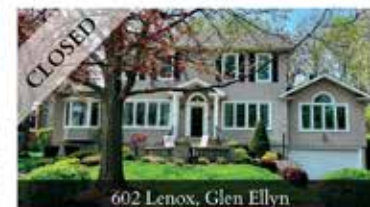
602 Lenox, Glen Ellyn